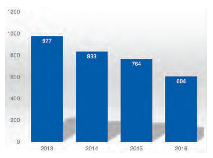
Figure 1: Total Number of Immunizations Provided by North Shore Health Department